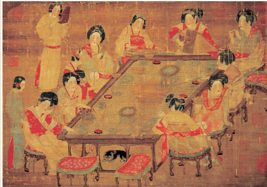
Visual Source 8.2 At Table with the Empress National Palace Museum, Taipei, Taiwan Chapter 8, Ways of the World: A Brief Global History with Sources , Second Edition Copyright © 2013 by Bedford/St. Martin's Page 406