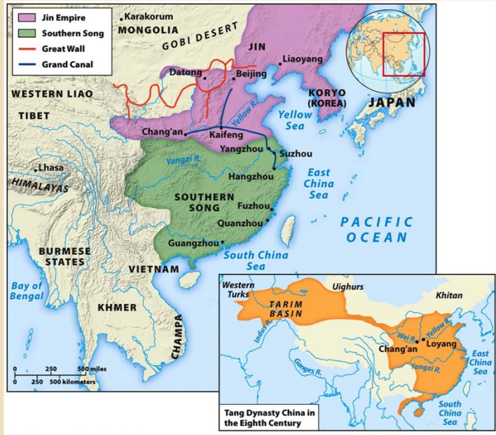
Map 8.1 Tang and Song Dynasty China Chapter 8, Ways of the World: A Brief Global History , Second Edition and Ways of the World: A Brief Global History with Sources , Second Edition Copyright © 2013 by Bedford/St. Martin's Page 252 (page 368, With Sources )