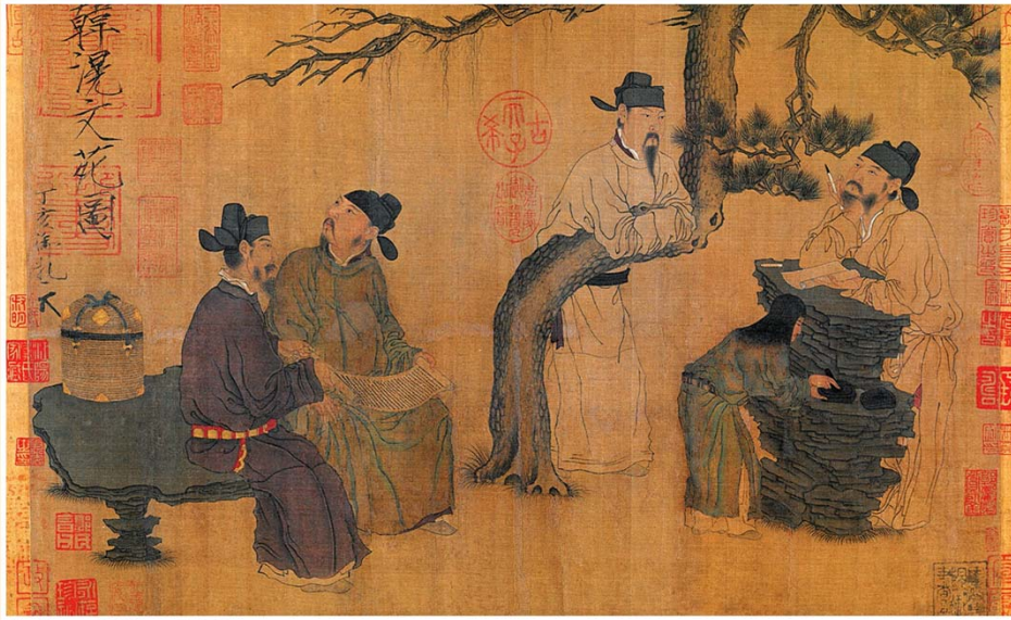
Visual Source 8.3 A Literary Gathering Palace Museum, Beijing Chapter 8, Ways of the World: A Brief Global History with Sources , Second Edition Copyright © 2013 by Bedford/St. Martin's Page 407