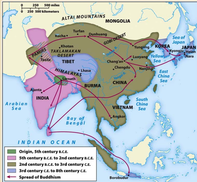
Map 8.5 The World of Asian Buddhism Chapter 8, Ways of the World: A Brief Global History , Second Edition and Ways of the World: A Brief Global History with Sources , Second Edition Copyright © 2013 by Bedford/St. Martin's Page 273 (page 389, With Sources)