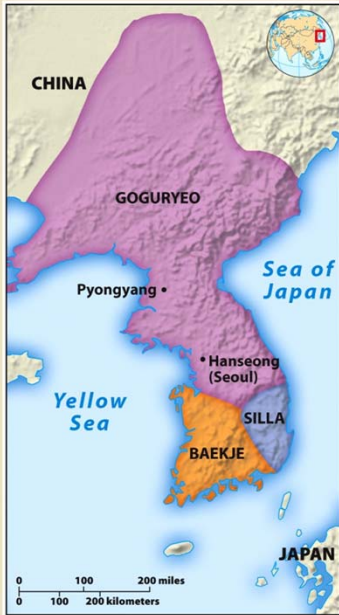
Map 8.2 Korean Kingdoms about 500 C.E. Chapter 8, Ways of the World: A Brief Global History, Second Edition and Ways of the World: A Brief Global History with Sources, Second Edition Copyright © 2013 by Bedford/St. Martin's Page 262 (page 378, With Sources)