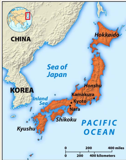
Map 8.4 Japan Chapter 8, Ways of the World: A Brief Global History, Second Edition and Ways of the World: A Brief Global History with Sources, Second Edition Copyright © 2013 by Bedford/St. Martin's Page 265 (page 381, With Sources)