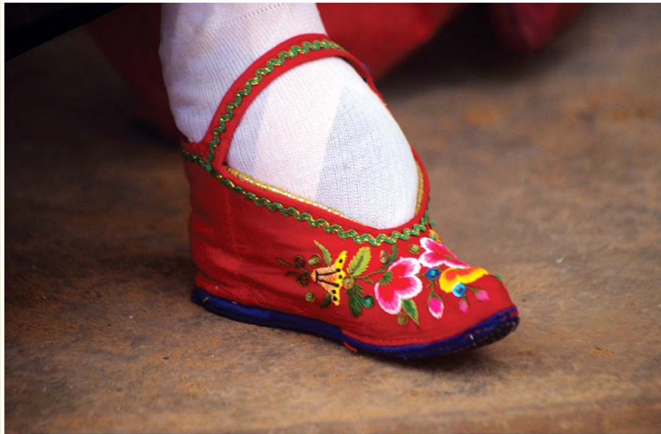
Foot Binding Chapter 8, Ways of the World: A Brief Global History, Second Edition and Ways of the World: A Brief Global History with Sources, Second Edition Copyright © 2013 by Bedford/St. Martin's Page 256 (page 372, With Sources)