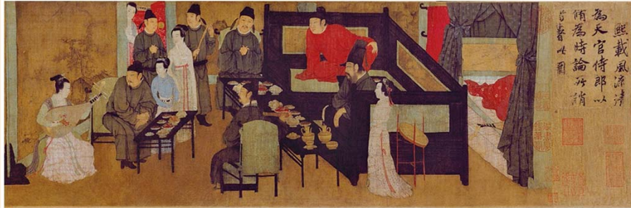
Visual Source 8.4 An Elite Night Party Palace Museum, Beijing Chapter 8, Ways of the World: A Brief Global History with Sources , Second Edition Copyright © 2013 by Bedford/St. Martin's Page 408