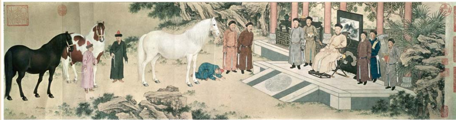
The Tribute System Chapter 8, Ways of the World: A Brief Global History, Second Edition and Ways of the World: A Brief Global History with Sources, Second Edition Copyright © 2013 by Bedford/St. Martin's Page 259 (page 375, With Sources)