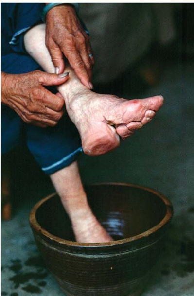
Foot Binding Chapter 8, Ways of the World: A Brief Global History, Second Edition and Ways of the World: A Brief Global History with Sources, Second Edition Copyright © 2013 by Bedford/St. Martin's Page 256 (page 372, With Sources)

1. What does the photograph on the left show?