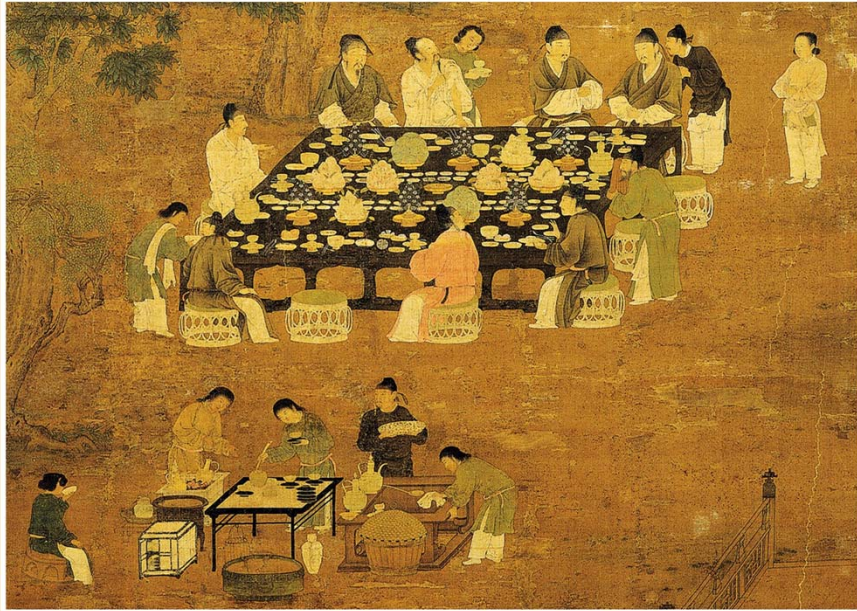
Visual Source 8.1 A Banquet with the Emperor National Palace Museum, Taipei, Taiwan Chapter 8, Ways of the World: A Brief Global History with Sources , Second Edition Copyright © 2013 by Bedford/St. Martin's Page 405